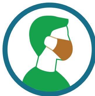
Wear a Mask 1