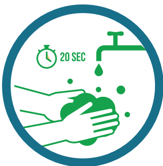
Wash your hands